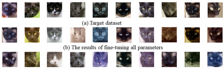
(c) The results of fine-tuning encoder and decoder