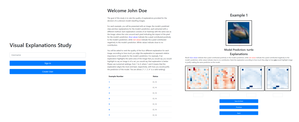
Figure 6: Login page (left), dashboard (middle) and annotation page (right)

The volunteers were a mixture of graduates or graduate students known by the authors. However we would like to point out that due to blind nature of the method annotation, the chance of bias is low.