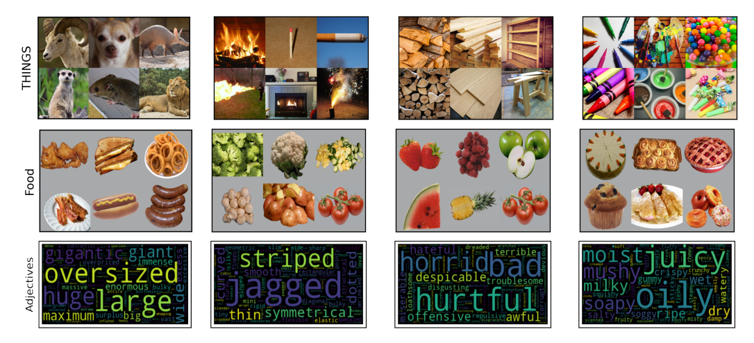
Figure 3: Four example VICE dimensions showing the top six objects for THINGS ( top ) and FOOD ( middle ), and wordclouds for ADJECTIVES ( bottom ).

One of the benefits of SPoSE is the interpretability of the dimensions of its concept embeddings which was evidenced through experiments with humans [19]. VICE dimensions are equally interpretable due to similar constraints on its embedding space. Therefore, it is easy to sort objects within a dimension of the VICE mean embedding matrix \mu in descending order, to obtain human judgments of what an embedding dimension represents. To illustrate the interpretability of VICE we show in Figure 3 four example dimensions of a representative model for THINGS, FOOD, and ADJECTIVES. For THINGS the dimensions appear to represent categorical, functional, structural , and color-related information. For FOOD the dimensions appear to be a combination of fried, vegetable, fruit , and sweet food items. For ADJECTIVES the dimensions seem to reflect size/magnitude, visual appearance ,