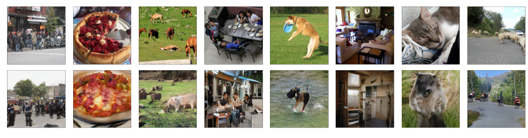
(a) Ground truth stimuli (top row) and generated images conditioned on fMRI (bottom row).