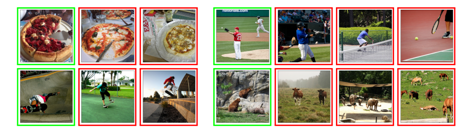
Figure 3: Mismatches are semantically close to the ground truth. Figure shows examples of incorrect matches j (red frame) in a batch of 300 in the validation set. For each ground truth image i (green frame), we pass it through CLIP encoder to get \mathbf{h}^{(i)} and through f_{mc} to get \mathbf{h}^{(i)'} . The shown incorrect ones are those images with \mathbf{h}^{(j)'} , j \neq i that is closer to \mathbf{h}^{(i)} than \mathbf{h}^{(i)'} .