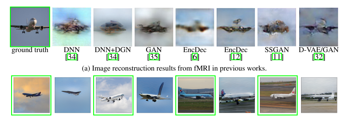
(b) Image reconstruction results from fMRI by our pipeline. Four ground truth images are green framed.