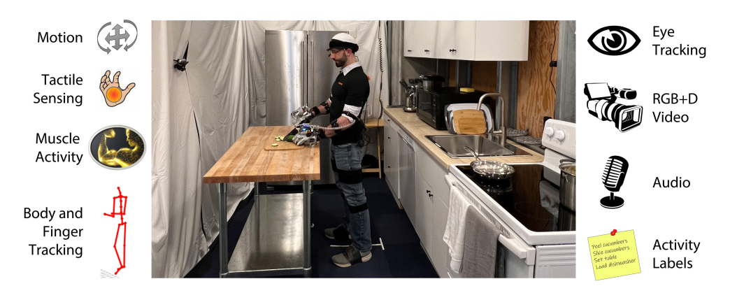
Figure 1: A suite of wearable and external sensors records rich activity information in a mock kitchen.

understanding of how humans perform dexterous manipulations or abstract tasks. As summarized in Figure 1, it uses a multimodal collection of wearable sensors including body trackers, first-person video with attention estimates, muscle activity sensors, and custom tactile gloves made with a matrix of conductive threads. This is coupled with synchronized global perspectives and ground truth data, including activity labels, video from multiple environment cameras, depth camera data, and audio.