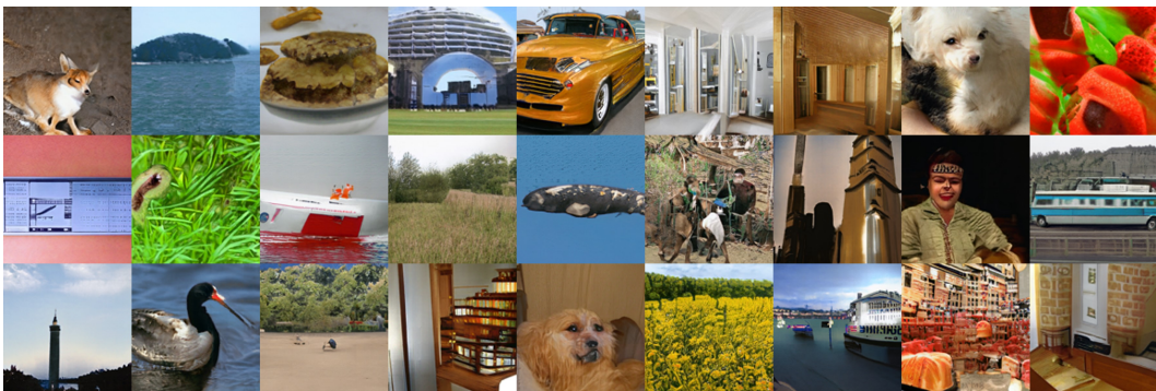
Figure 3: Unconditional image generation results of HiT trained on ImageNet 128 \times 128 .

is slightly better than BigGAN and achieves the state of the art among models with a similar capacity as shown in Table 1. We also note that [8, 36] leverage auxiliary regularization techniques and our method is complementary to them. Examples generated by HiT on ImageNet are shown in Figure 3, from which we observe nature visual details and diversity.