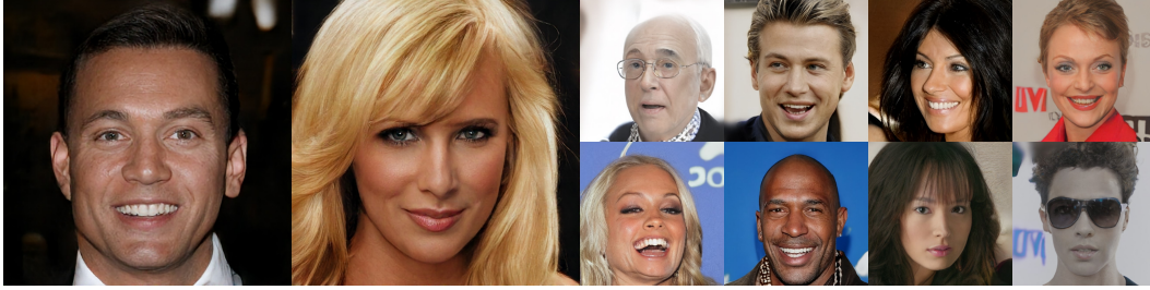
Figure 4: Synthetic face images by HiT-B trained on CelebA-HQ 1024 \times 1024 and 256 \times 256 .