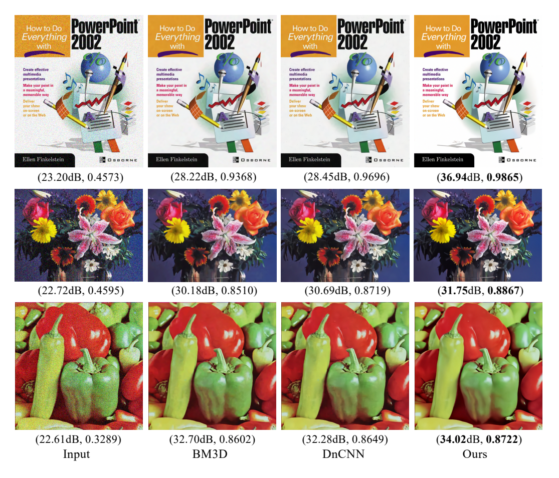
Figure 2: Image denoising examples of Set14. The values beneath images represent the PSNR(dB) and SSIM. The standard deviation of noise is set to 35.

As shown in Figure 2, more denoised examples of Set14 dataset are visualized. Compared with other methods [7, 8], for the first example, our LAPAR restores the original white background color nicely. At the same time, the details of all the pictures are better preserved in our results.