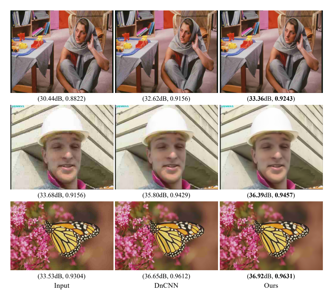
Figure 3: Image deblocking examples of Set14. The values beneath images represent the PSNR(dB) and SSIM. The JPEG quality is set to 20.

As the testing cases illustrated in Figure 3, our LAPAR successfully removes the JPEG compression artifacts and achieves superior results compared with DnCNN [8].