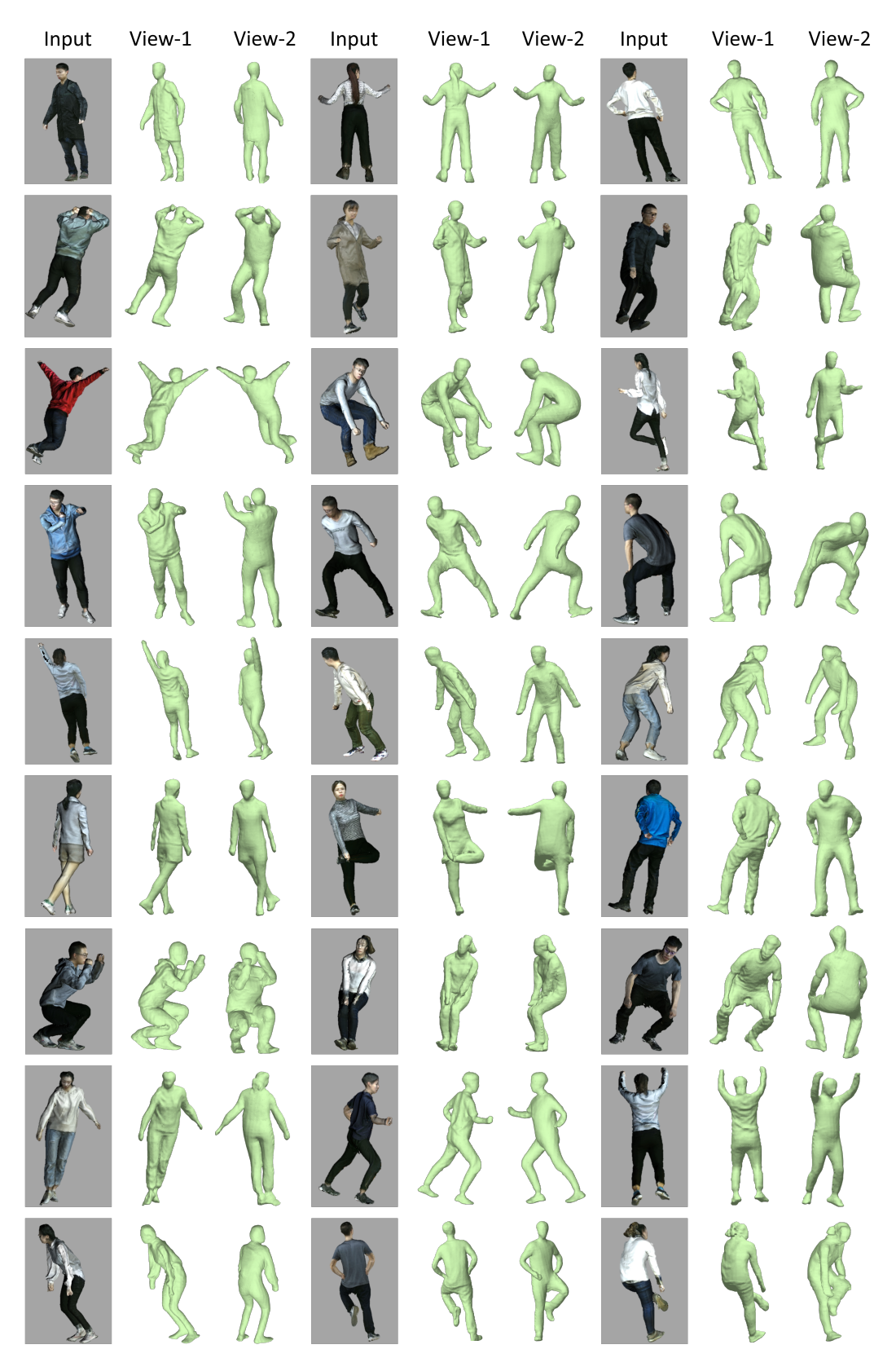
Figure 2: Single-view clothed human mesh reconstruction of our method Geo-PIFu.