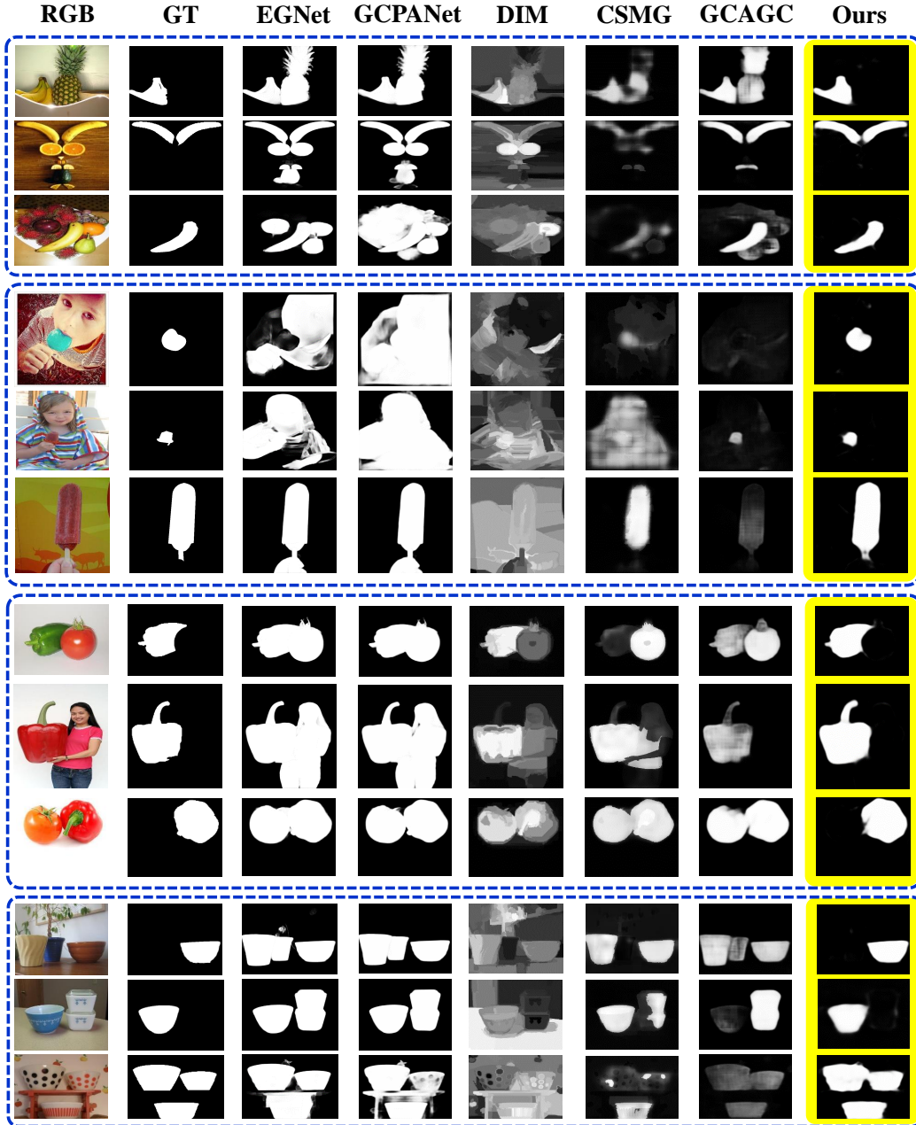
Figure 1: Visual examples of co-saliency maps generated by different methods. Our method with the Dilated ResNet-50 backbone is marked with the yellow shading.