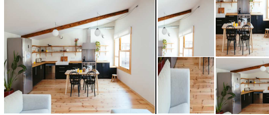
Figure 1: Aggressive Augmentation Contrastive self-supervised learning methods employ an aggressive cropping strategy to generate positive pairs. Through this strategy, an image (left) yields many non-overlapping crops (right) as samples. We can observe that the crops do not necessarily depict objects of the same category. Therefore, a representation that matches features of these crops would be detrimental for object recognition tasks.

Occlusion invariance is a critical attribute for useful representations, but is artificially cropping images the right way to achieve it? The contrastive loss explicitly encourages minimizing the feature distance between positive pairs. In this case, the pair would consist of two possibly non-overlapping cropped regions of an image. For example, in the case of an indoor scene image, one sample could depict a chair and another could depict a table. Here the representation would be forced to be bad at differentiating these chairs and tables - which is intuitively the wrong objective! So why do these approaches work? We hypothesize two possible reasons: (a) The underlying biases of pre-training dataset - Imagenet is an object-centric dataset which ensures that different crops correspond to different parts of same object; (b) the representation function is not expressive enough to optimize this faulty objective, leading to a sub-optimal representation which works well in practice. We demonstrate through diagnostic experiments that indeed the success of these approaches originates from the object-centric bias of the training dataset. This suggests that the idea of employing aggressive synthetic augmentations must be rethought and improved in future work to ensure scalability.