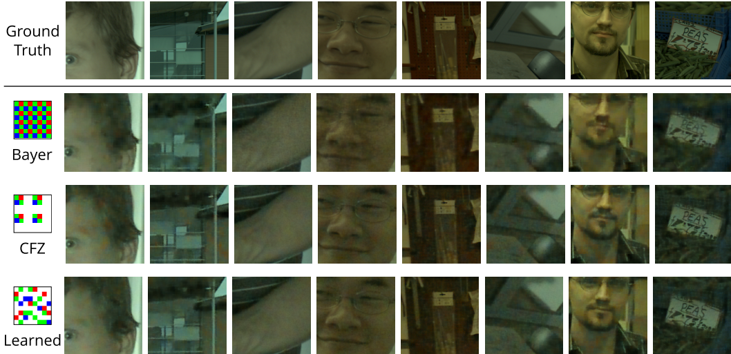
Figure 3: Example reconstructions from (noisy) measurements with different sensor multiplexing patterns. Best viewed at higher resolution in the electronic version.

is likely because early on in the training process, the reconstruction network hasn’t yet learned to exploit cross-channel correlations, and therefore needs to measure the output channels directly.