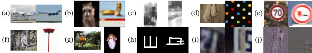
Figure 1: Visual Decathlon . We explore deep architectures that can learn simultaneously different tasks from very different visual domains. We experiment with ten representative ones: (a) Aircraft, (b) CIFAR-100, (c) Daimler Pedestrians, (d) Describable Textures, (e) German Traffic Signs, (f) ILSVRC (ImageNet) 2012, (g) VGG-Flowers, (h) OmniGlott, (i) SVHN, (j) UCF101 Dynamic Images.

be largely shareable. Sharing knowledge between domains should allow to learn compact multivalent representations. Provided that sufficient synergies between domains exist, multivalent representations may even work better than models trained individually on each domain (for a given amount of training data).