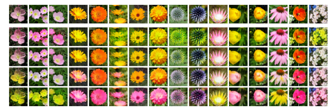
Figure 5: Examples of reconstructed flowers with different values of the pink attribute. First row images are the originals. Increasing the value of that attribute will turn flower colors into pink, while decreasing it in images with originally pink flowers will make them turn yellow or orange.

We performed additional experiments on the Oxford-102 dataset, which contains about 9,000 images of flowers classified into 102 categories [17]. Since the dataset does not contain other labels than the flower categories, we built a list of color attributes from the flower captions provided by [19]. Each flower is provided with 10 different captions. For a given color, we gave a flower the associated color attribute, if that color appears in at least 5 out of the 10 different captions. Although being naive, this approach was enough to create accurate labels. We resized images to 64 \times 64 . Figure 5 represents reconstructed flowers with different values of the "pink" attribute. We can observe that the color of the flower changes in the desired direction, while keeping the background cleanly unchanged.