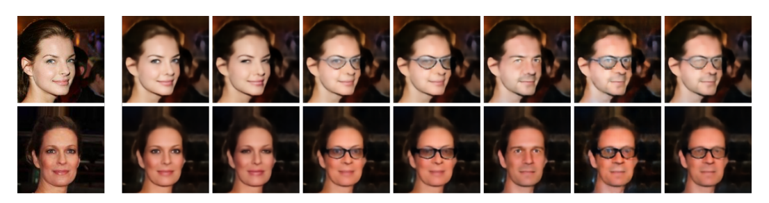
Figure 4: (Zoom in for better resolution.) Examples of multi-attribute swap (Gender / Opened eyes / Eye glasses) performed by the same model. Left images are the originals.

Quantitative results In the naturalness experiments, only around 90% of real images were classified as "real" by the Workers, indicating the high level of requirement to generate natural images. Our model obtained high naturalness accuracies when reconstructing images without swapping attributes: 88.4%, 75.2% and 78.8%, compared to IcGAN reconstructions whose accuracy does not exceed 23%, whether it be for reconstructed or swapped images. For the swap, FADNET SWAP still consistently outperforms ICGAN SWAP by a large margin. However, the naturalness accuracy varies a lot based on the swapped attribute: from 79.0% for the opening of the mouth, down to 31.4% for the smile.