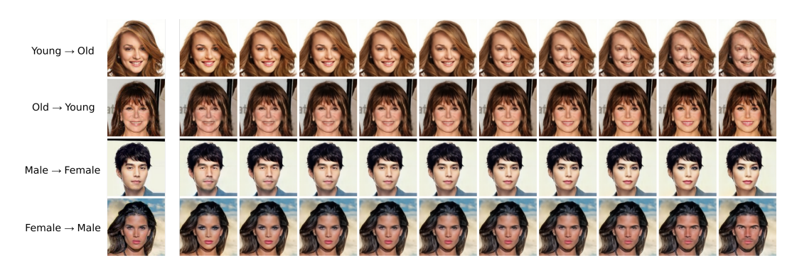
Figure 1: Interpolation between different attributes (Zoom in for better resolution). Each line shows reconstructions of the same face with different attribute values, where each attribute is controlled as a continuous variable. It is then possible to make an old person look older or younger, a man look more manly or to imagine his female version. Left images are the originals.

The fundamental feature of our approach is to constrain the latent space to be invariant to the attributes of interest. Concretely, it means that the distribution over images of the latent representations should be identical for all possible attribute values. This invariance is obtained by using a procedure similar to domain-adversarial training (see e.g., [21, 6, 15]). In this process, a classifier learns to predict the attributes y given the latent representation z during training while the encoder-decoder is trained based on two objectives at the same time. The first objective is the reconstruction error of the decoder, i.e., the latent representation z must contain enough information to allow for the reconstruction of the input. The second objective consists in fooling the attribute values. In this model, achieving invariance is a means to filter out, or hide, the properties of the image that are related to the attributes of interest. A single latent representation thus corresponds to different images that share a common structure but with different attribute values. The reconstruction objective then forces the decoder to use the attribute values to choose, from the latent representation, the intended image.