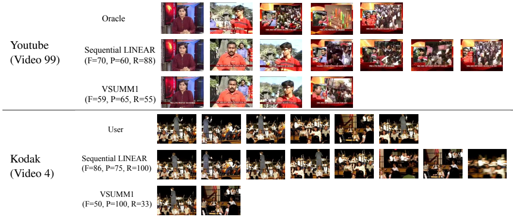
Figure 3: Exemplar video summaries by our seqDPP LINEAR vs. VSUMM summary [24].

Unsupervised or supervised? The four unsupervised methods are DT [30], STIMO [31], VSUMM 1 [24], and VSUMM 2 with a postprocessing step to VSUMM 1 to improve the precision of the results. We implement VSUMM ourselves using features described in the original paper and tune its parameters to have the best test performance. All 4 methods use clustering-like procedures to identify key frames as video summaries. Results of DT and STIMO are taken from their original papers. They generally underperform VSUMM.