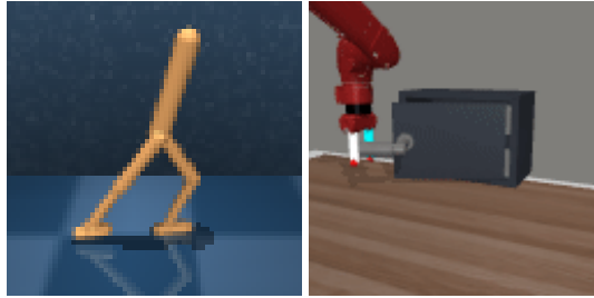
Figure 3: Our image-based environments: The observations are 64 \times 64 and 128 \times 128 raw RGB images for the walker-walk and sawyer-door tasks respectively. The sawyer-door-close environment used in in Section 5.1 also uses the sawyer-door environment.

We visualize our image-based environments in Figure 3. We use the standard walker-walk environment from Tassa et al. [61] with 64 \times 64 pixel observations and an action repeat of 2. Datasets were constructed the same way as Fu et al. [12] with 200 trajectories each. For the sawyer-door we use 128 \times 128 pixel observations. The medium-expert dataset contains 1000 rollouts (with a rollout length of 50 steps) covering the state distribution from grasping the door handle to opening the door. The expert dataset contains 1000 trajectories samples from a fully trained (stochastic) policy. The data was obtained from the training process of a stochastic SAC policy using dense reward function as defined in Yu et al. [66]. However, we relabel the rewards, so an agent receives a reward of 1 when the door is fully open and 0 otherwise. This aims to evaluate offline-RL performance in a sparse-reward setting. All the datasets are from [48].